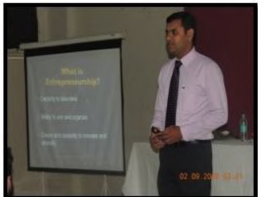
GUEST LECTURE ON EDP