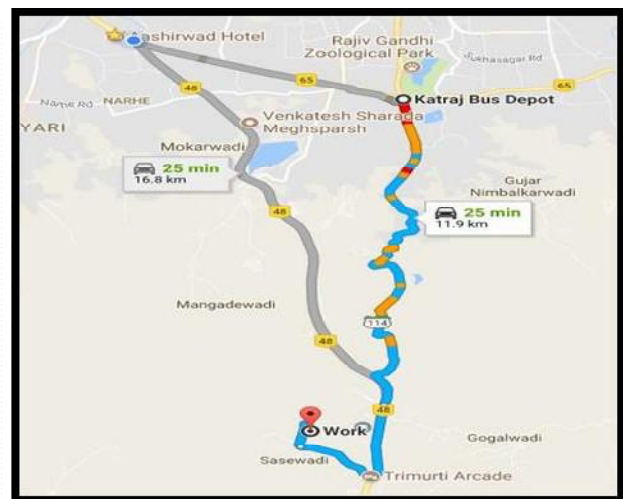
Katraj to UCOER