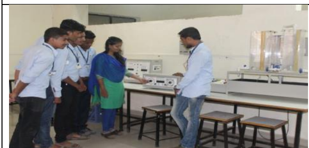
CONTROL SYSTEM LAB