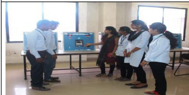
SWITCHGEAR AND PROTECTION LAB