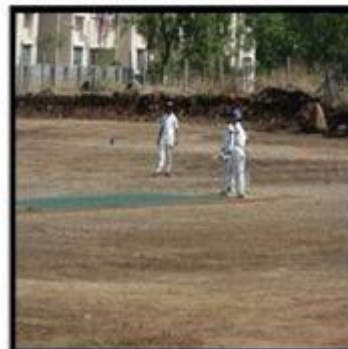
UCOER - Play Ground