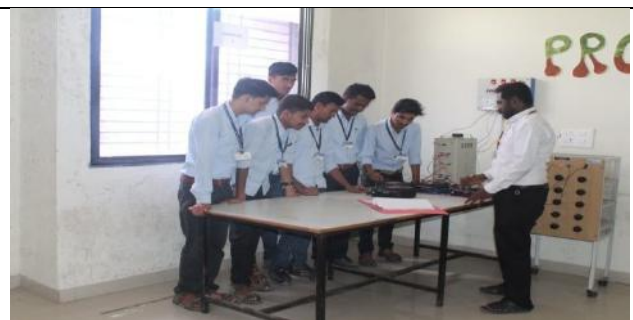
ELECTRICAL MEASUREMENT AND INSTRUMENTATION LAB