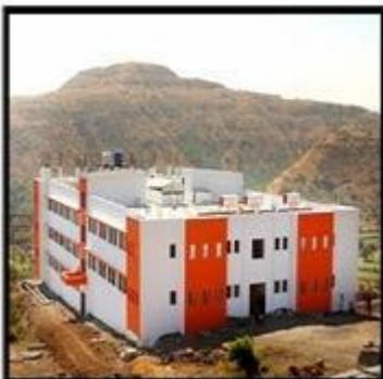
UCOER - Hostel