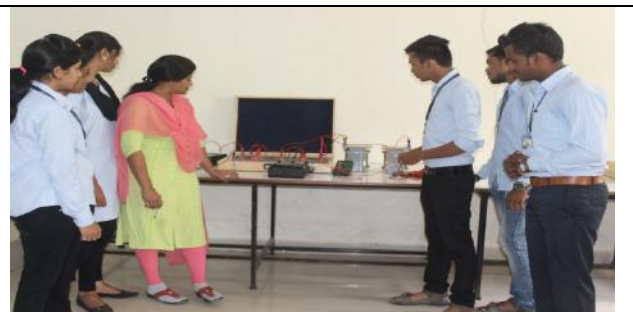
POWER SYSTEM LAB