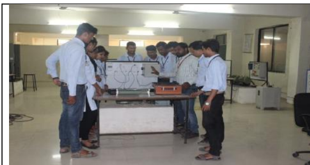
ELECTRICAL MACHINE LAB